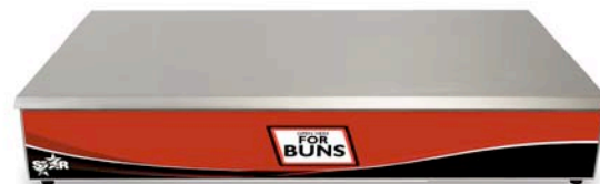
XBW50 BUN WARMER