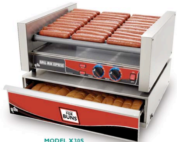
MODEL X30S SHOWN WITH OPTIONAL XBW30 BUN BOX

We improved our Seal-Max ® system by adding colored seals which provide quick, visual identification of front and rear zones. The dual seal system, one internal and one external seal at each roller, thus eliminating the potential for grease and food particles to enter the drive system.