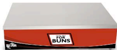
XBW30 BUN WARMER